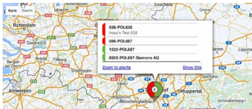
Climatix IC – map and key performance indicator

Siemens Switzerland Ltd Building Technologies Division International Headquarters Gubelstrasse 22 6301 Zug Switzerland Tel. +41 41 724 24 24